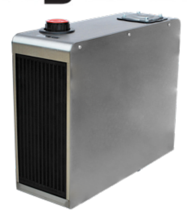
Perfect for "Behind the Cab" mounting